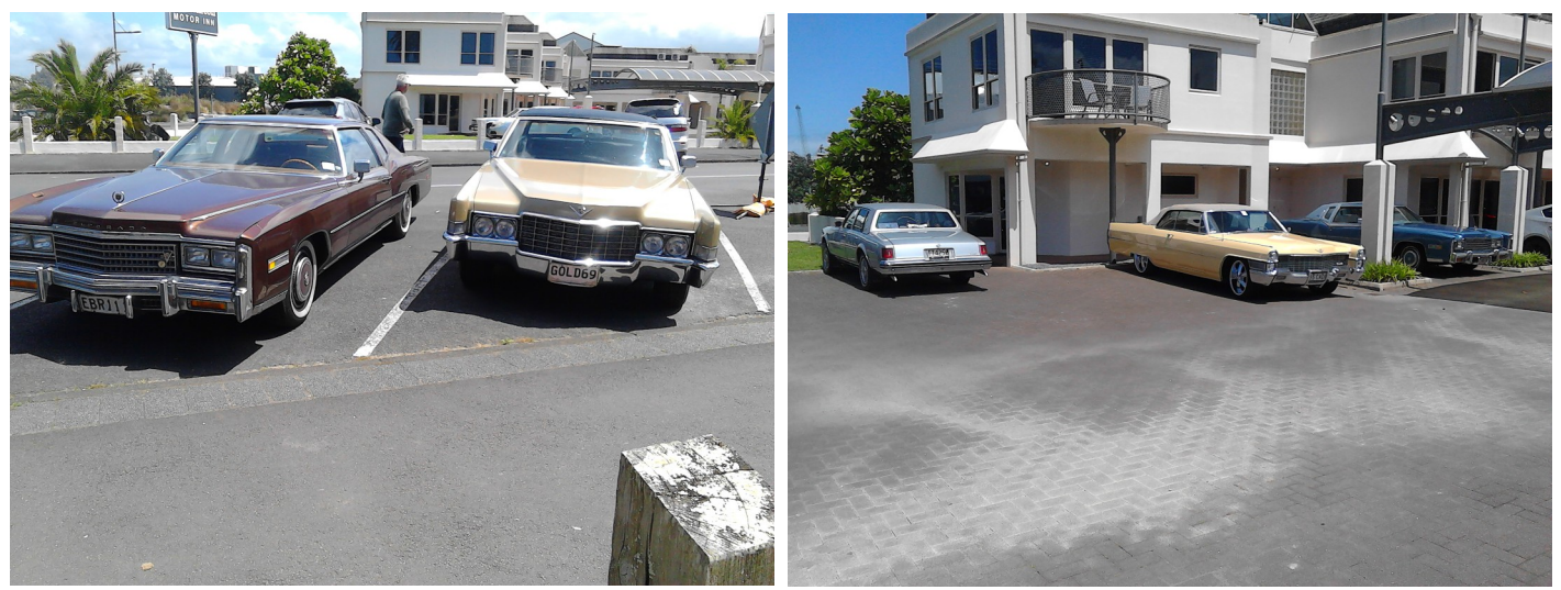
Some of the Cadillacs spotted in and around the Pacific Harbour Motor Inn.